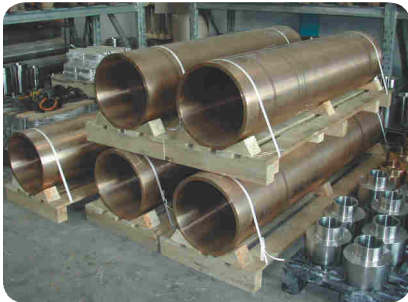
LG4 shaft liners