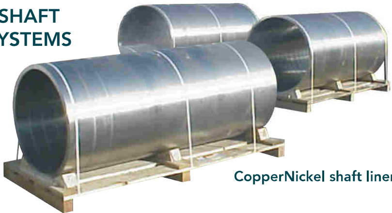
CopperNickel shaft liners