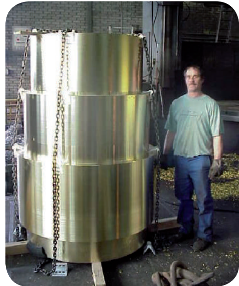
SCREW NUTS Material: Tin Bronze