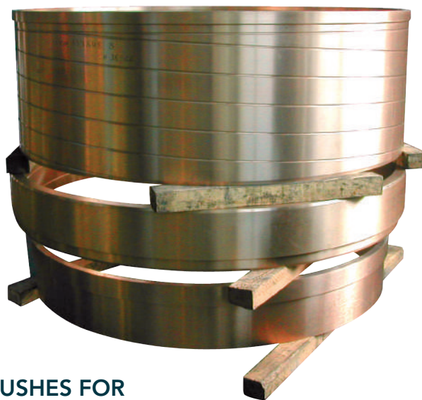
BUSHES FOR TRANSVERSE SHAFT Material: Tin Bronze