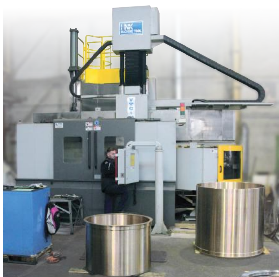
▼ NEW 3-Axes Vertical HNK Lathe OD 1,600mm