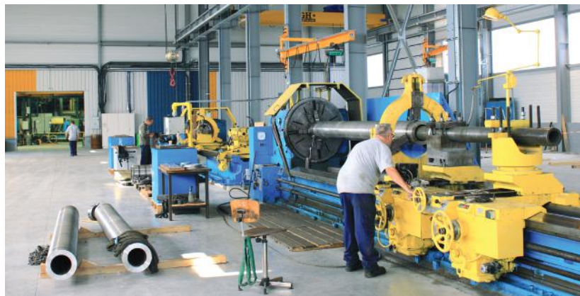
▲ NEW CNC parallel TACCHI lathe OD 900 x lg. 10,000mm