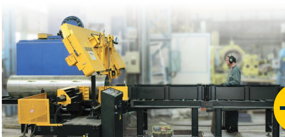
▲ NEW 1 x fully automatic Band Saw

▼ NEW 2 x CNC Horizontal twin Spindle PUMA lathes for rough machining