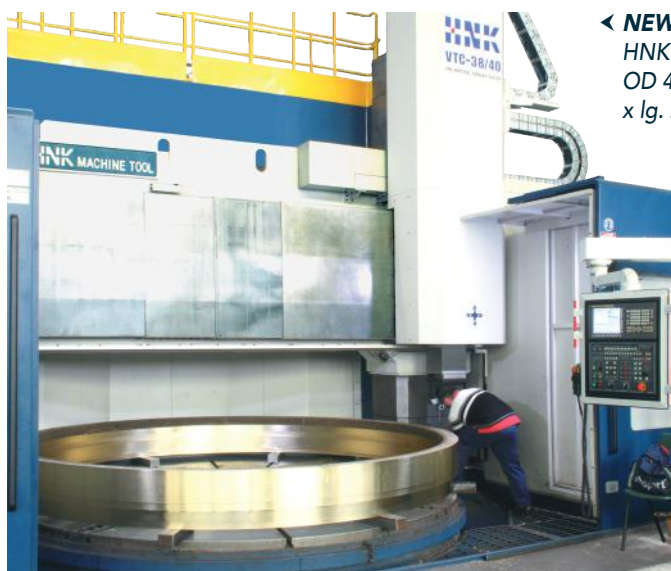
◀ NEW 3-Axes Vertical HNK Lathe OD 4,000mm x lg. 2,000mm